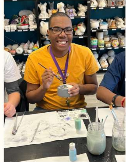
Getting creative at MADE Art Studio

The Pathways Program offers several opportunities for our students to engage with professionals in the arts, athletics, business, health sciences, and ministry. The pathways program at Our Savior Lutheran School, aims to help Student-Athletes, Student-Artists, and Student-Entrepreneurs learn how to cast and pursue goals in alignment with their God-given gifts and talents.