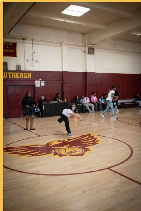
Students with an athletic focus practice their volleyball moves.