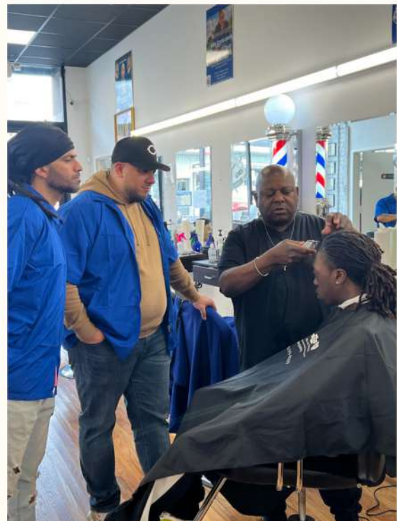
Westchester Barber Academy